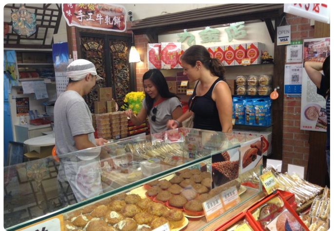
Fieldwork as part of 2018 Taiwan program

Our educational philosophy is rooted in experiential education and critical thinking. The organization's programs utilize project based learning, design thinking, and service-learning approaches in order to provide educators with hands on experiences allowing them to learn about other cultures and societies first-hand.